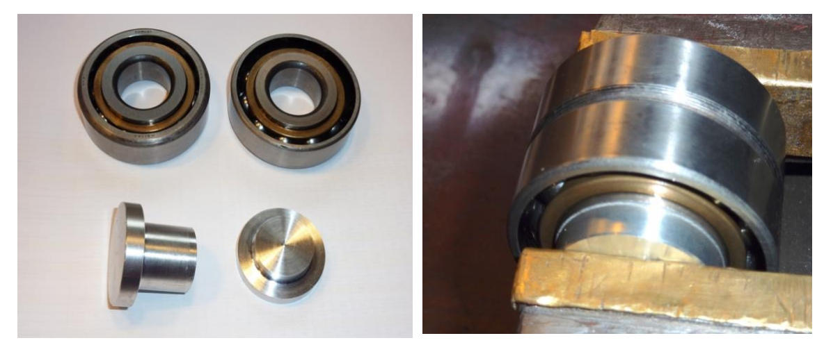
Front AC mains and support buttons