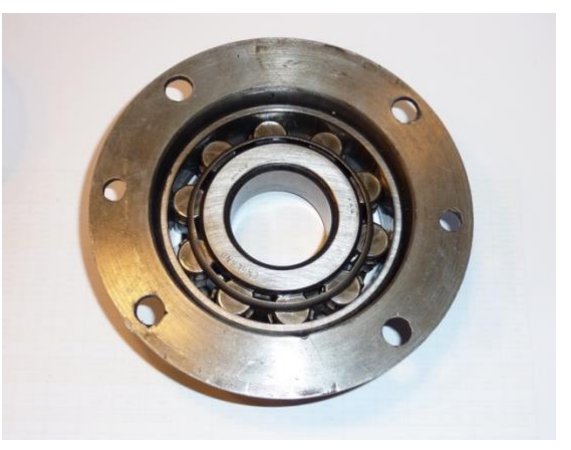
Rear main in its housing

Rear – The rear main bearing is a simple roller affair that handles radial loads well but offers no resistance to crankshaft axial loads and it seems to attract some bad press with frequent accusations of rumble. New ones seem to have just one or two thou clearance but in my experience, even quite tired ones often don't have a great deal more. It is widely believed that a beautiful new specimen will quickly wear and then go-on for years so long as the engine oil is frequently changed and the car is in regular use. It seems that rear mains can suffer through condensation and subsequent corrosion of the roller tracks if the car spends long periods standing idle and this might be the source of some unwanted noise.