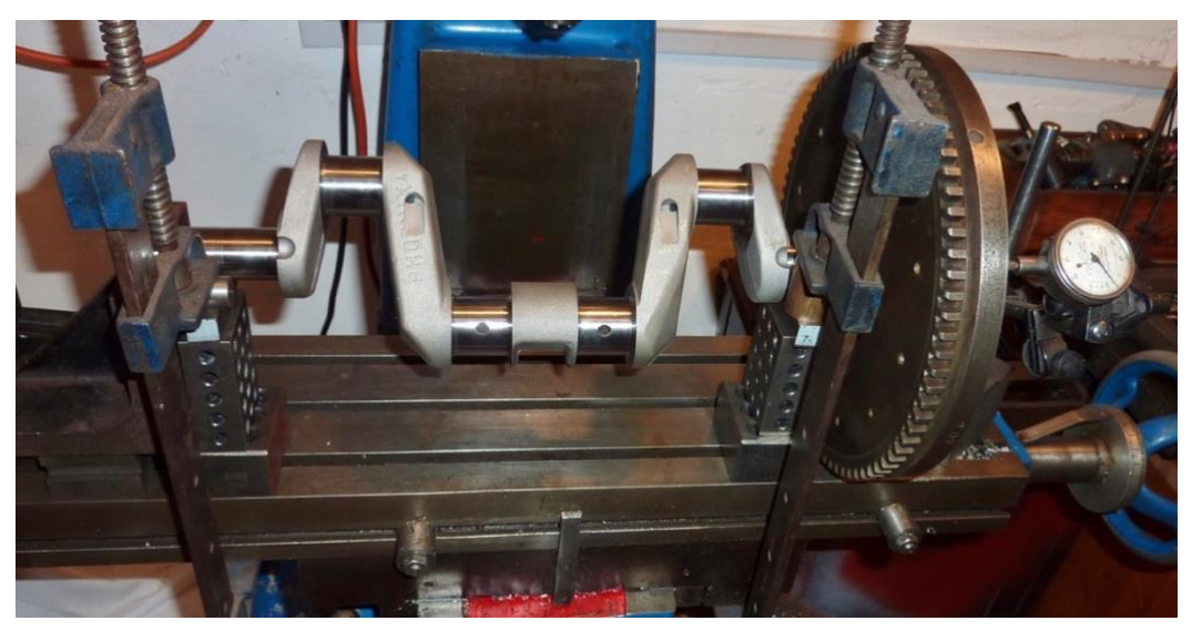
Checking flywheel runout

The flywheel is firmly tightened onto the crank' with the woodruff key in position and the assembly is rotated slowly by hand whilst keeping it pushed firmly against the 'stop' clamped at the front end of the crank'. Obviously the face of the flywheel needs to be perfectly clean where the dial gauge runs, nevertheless it is not uncommon to get erratic readings with very slight rotations of the assembly. So, I tend to take an average of several readings close to four (north, south, east & west) positions of the rim.